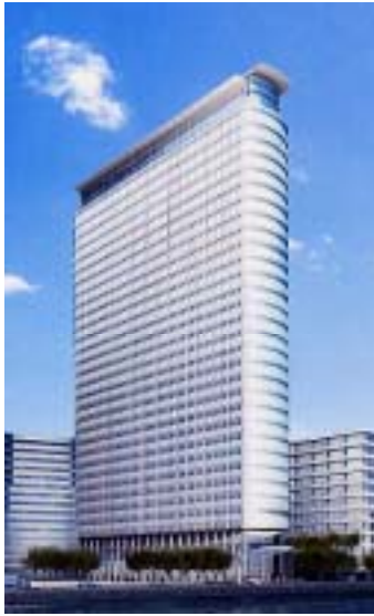
Nakanoshima Mitsui Bldg.