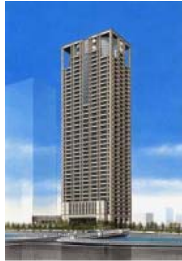
Shin Kanden Bldg.

Conclusion: As stated above, if not to the same extent as in Tokyo, there are plans for a considerable supply of new floor space, and the Osaka office demand which we are concerned about has hardly any expansion factors. Intensified competition for tenants therefore seems inevitable. On the other hand, tenants are expected to concentrate in quality properties, so if appropriate investment can be made in quality properties, then it may be described as a market which can yield satisfactory returns.