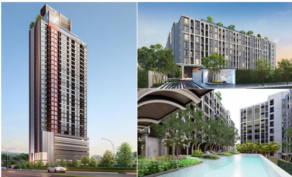
Left: External view of ORIGIN PLAY BANGSAEN