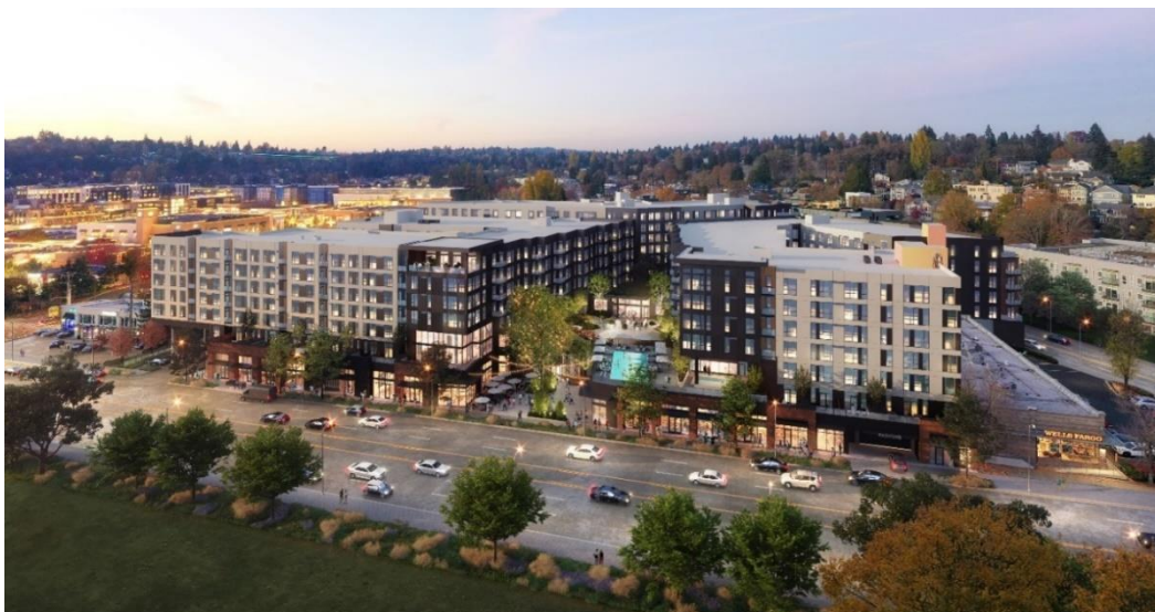
【A rendering of the planned property】

This represents a significant milestone as it marks Nomura's very first venture in Seattle. Moreover, we are pleased to collaborate with MacNaughton Inc. ("MacNaughton"), a Hawaii-based company with extensive experience in luxury residential developments. In turn, MacNaughton is partnering with Quatterra Multifamily Communities, LLC ("Quatterra"), a wholly-owned subsidiary of Lennar Corporation, one of the leading homebuilders in the United States, specializing in rental apartment developments.